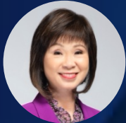
Dr Amy Khor Senior Minister of State Singapore

28 th & 29 th May 2024 | PAN PACIFIC HOTEL – MARINA BAY