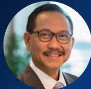
Dr Bambang Susantono Nusantara Capital City Authority