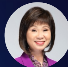
Dr Amy Khor Senior Minister of State Ministry of Sustainability and the Environment & Ministry of Transport Singapore